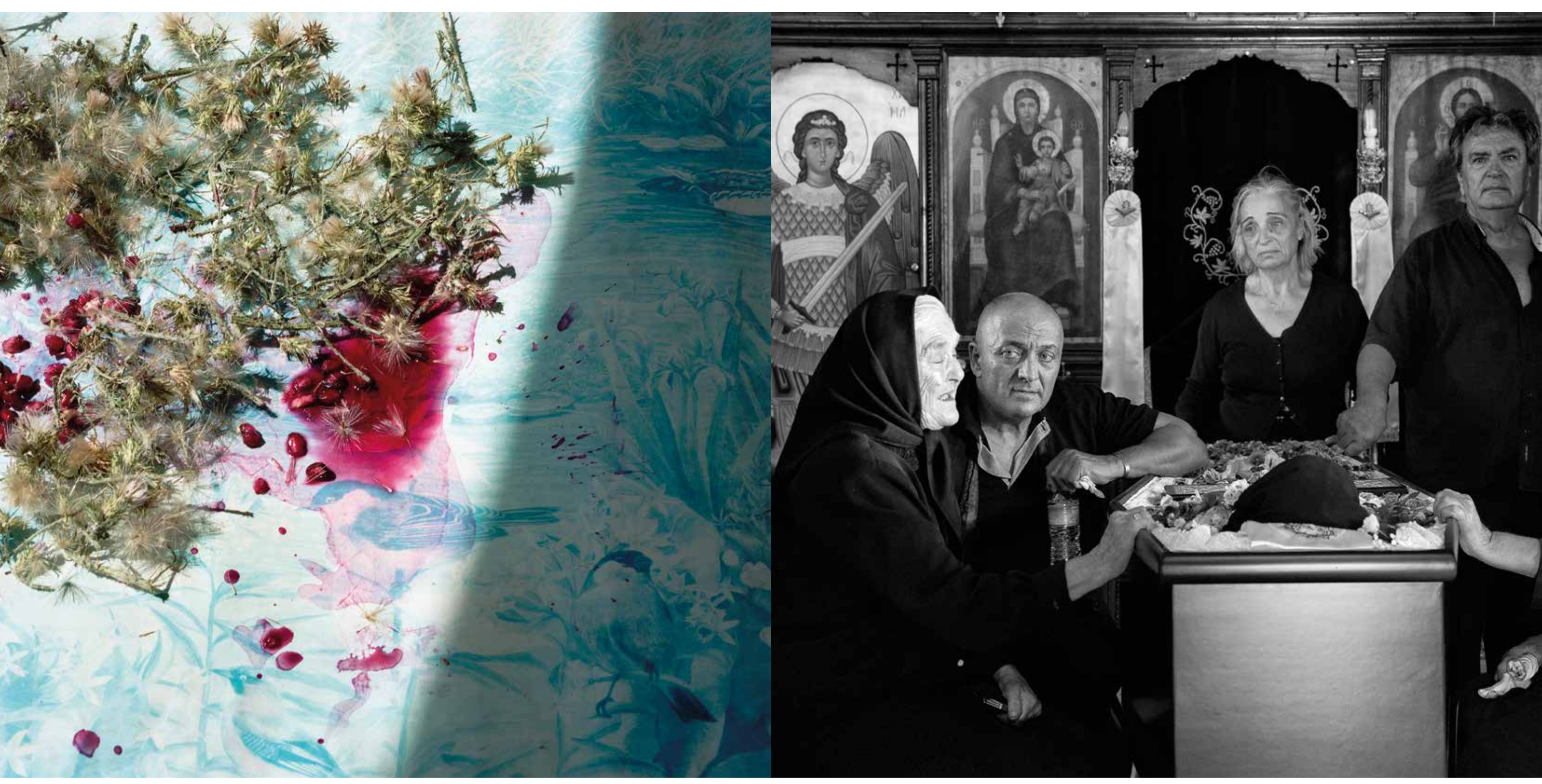
'Blood of Adonis (death and rebirth)', analogue medium-format film negative, scanned and post-edited digitally, The truth is in the soil, 2018