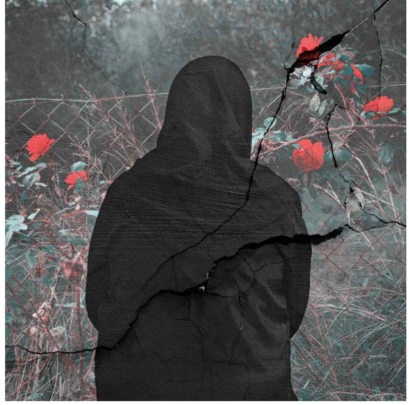
'Stygere (hateful)', analogue medium-format film negative, scanned and post-edited digitally, The truth is in the soil, 2019

The project also allowed Sakellaraki to work with her photographs as