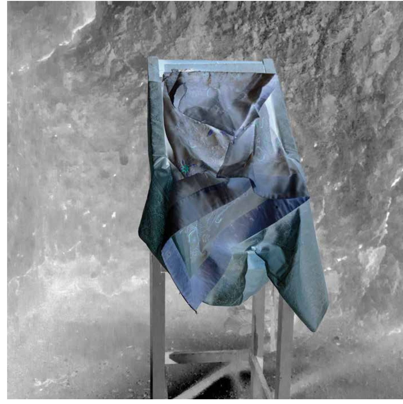
'Kerostasia (weighing of death)', analogue medium format film negative, scanned and post-edited digitally, The truth is in the soil, 2018