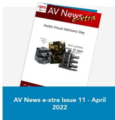
AV News e-xtra Issue 11 - April 2022