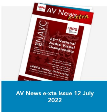
AV News e-xtra Issue 12 July 2022