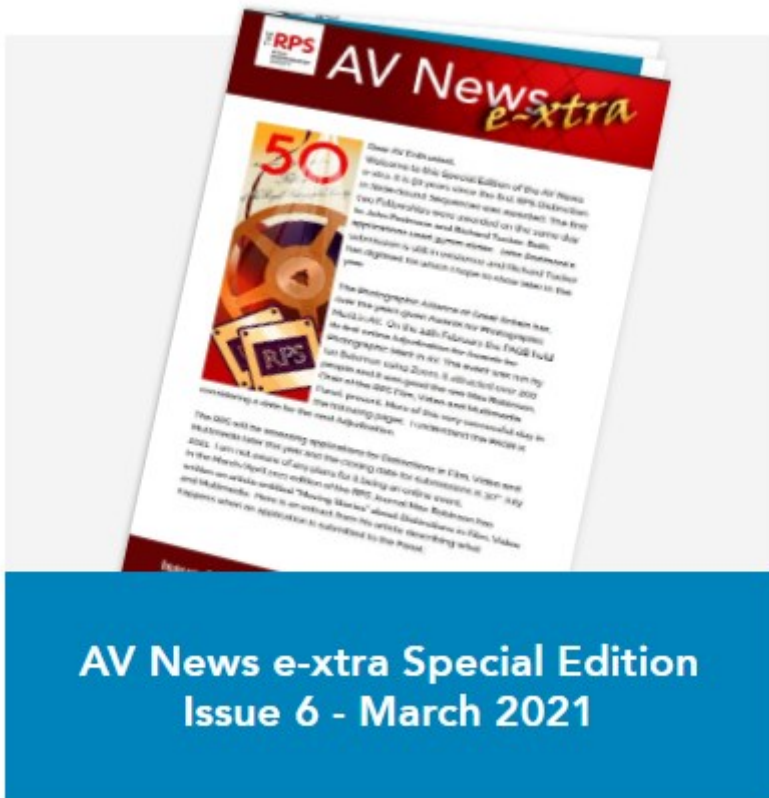
AV News e-xtra Special Edition Issue 6 - March 2021