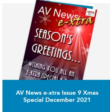
AV News e-xtra Issue 9 Xmas Special December 2021