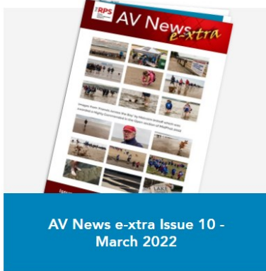
AV News e-xtra Issue 10 - March 2022