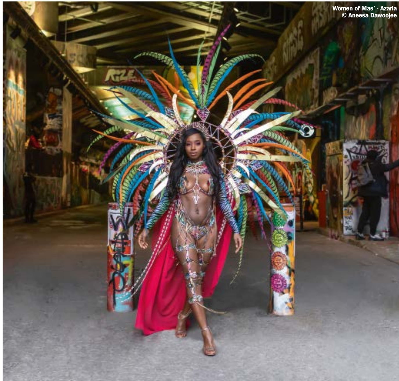
Women of Mas' - Azaria